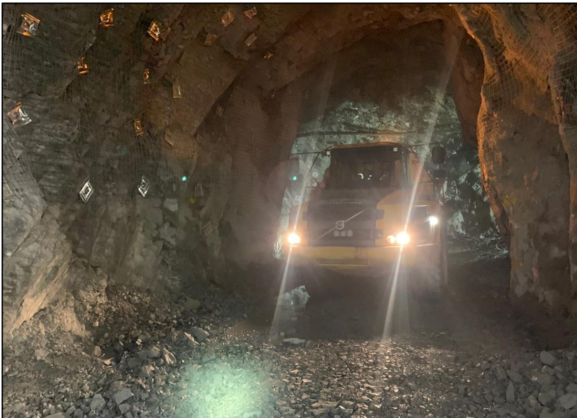
Figure 3 – Truck being loaded at Cross-Cut 4