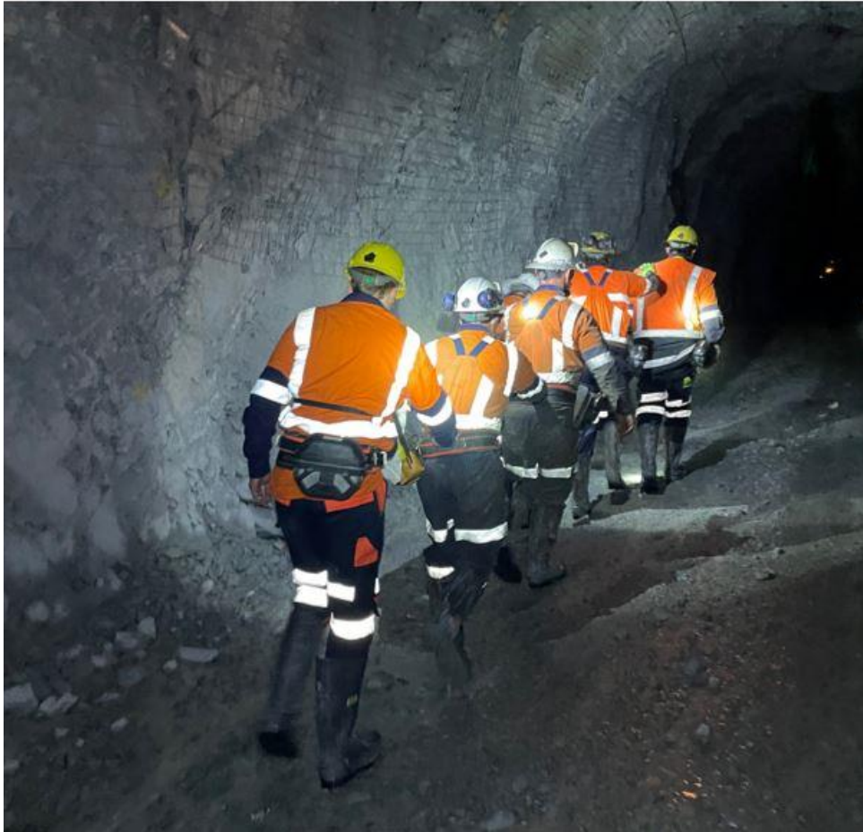
Figure 4 – Crews participating in safety drill