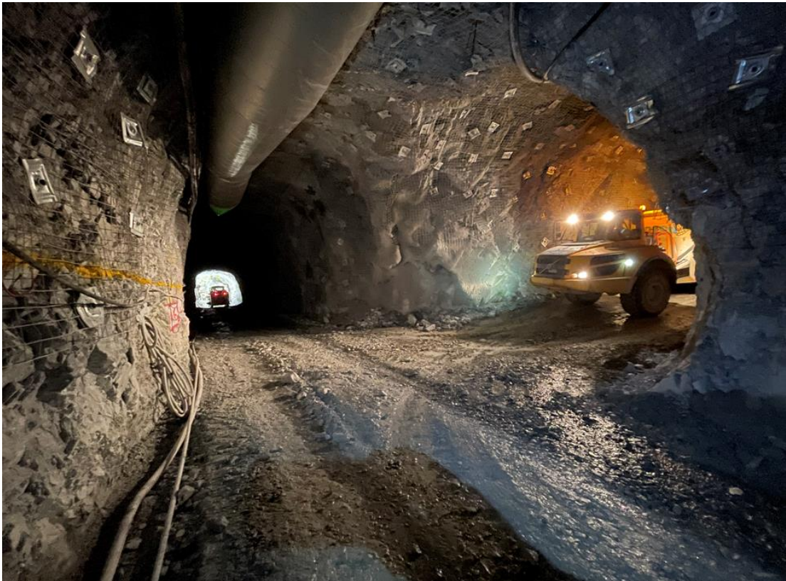
Jumbo working in the North Decline while the truck waits to be loaded