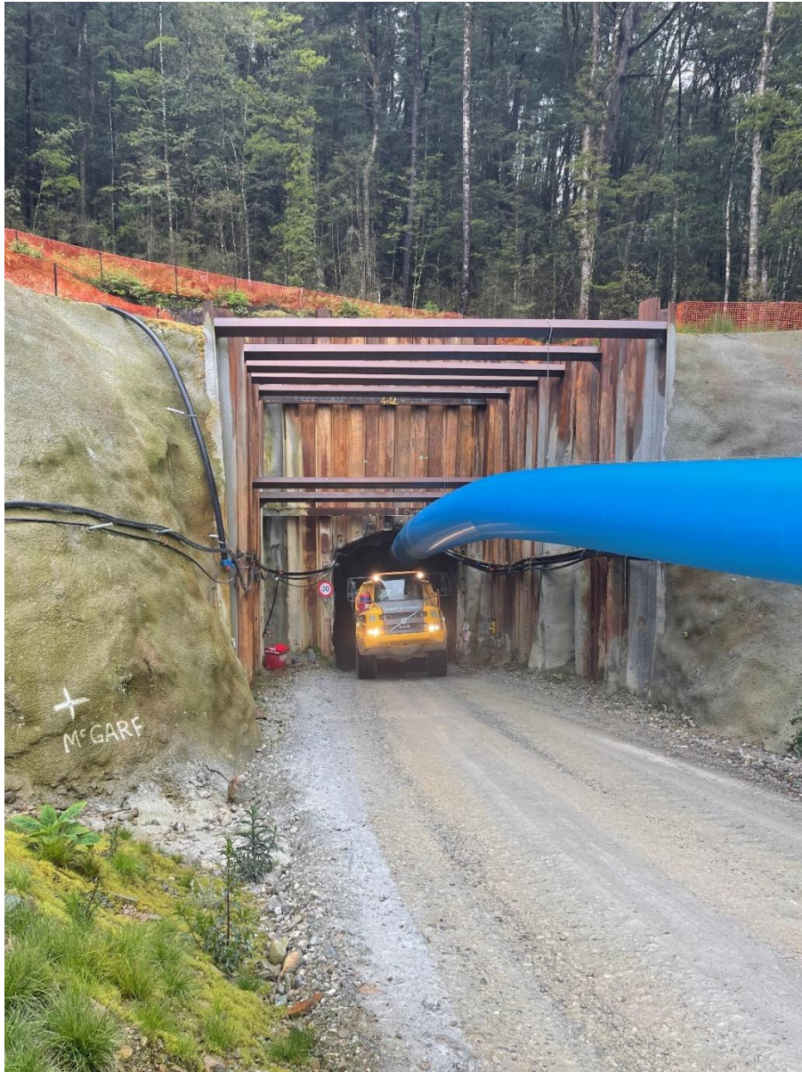
Truck exiting the Main Decline