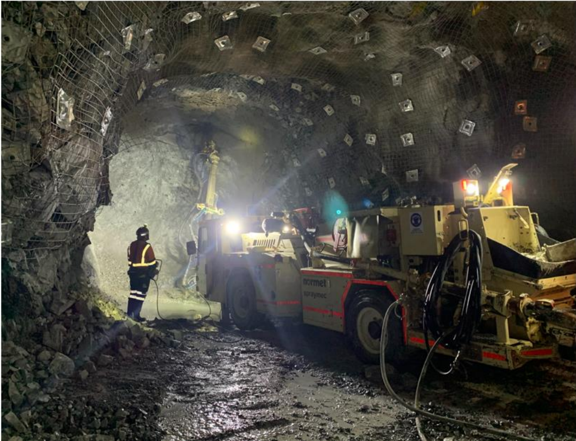
Shotcrete being applied in the Declines