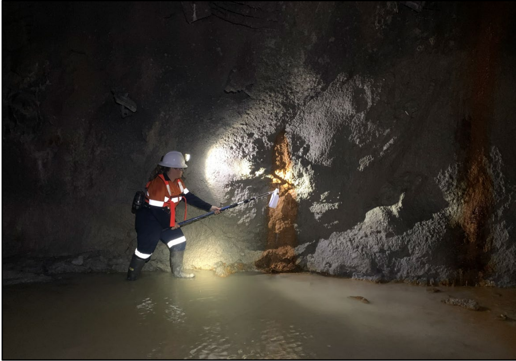
Water sampling underground