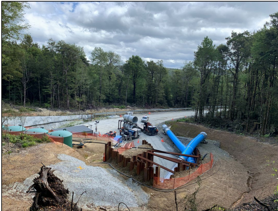
Portal works for the installation of the Primary Fan